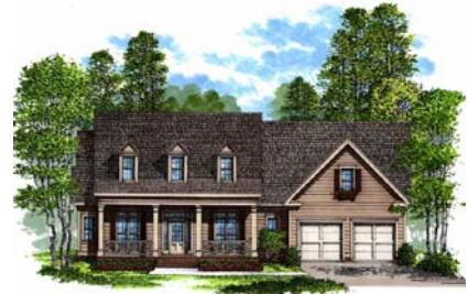
The Dogwood 2,617 approx. heated sq. ft.